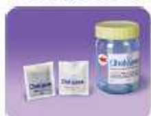
1. Media pouches & sterile bottle