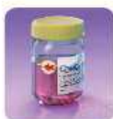
6. Then observe the colour of liquid in bottle

If the Colour is Violet Water Is Potable