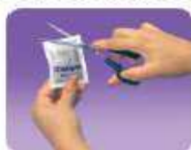
2. Cut open both the pouches carefully