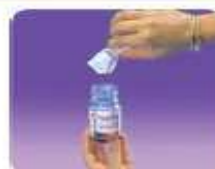
3. Pour the contents of both pouches into the bottle